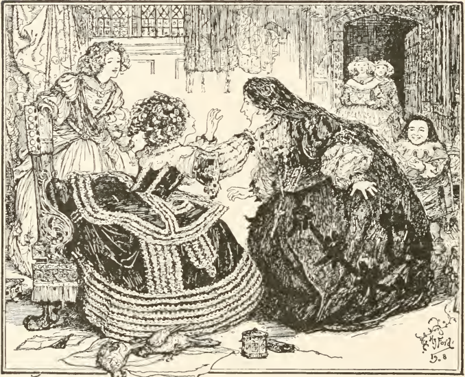
The Camarera Mayor gets her ears boxed!

as much as from the blow, but her furious words were checked on her tongue at the sight of the still, pale girl whose face was so new to her. Leaving the room, she summoned all her relations, and, choking with anger, she informed them of the insult she had received; then, accompanied by no less than four hundred kinsfolk, all belonging to noble families, she went to complain to the king.